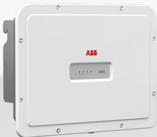
— UNO-DM-6.0-TL-PLUS-Q outdoor string inverter