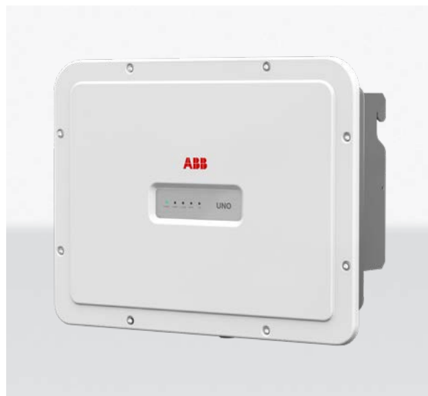
ABB string inverters UNO-DM-6.0-TL-PLUS-Q 6 kW