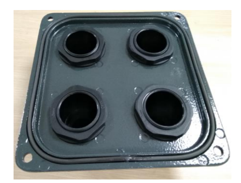
Fig.3. Spare AC Sealing Plate