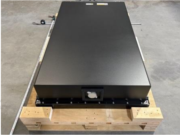
电池外观 Battery appearance